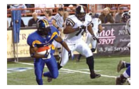
The Stampede, in action from last year.

The 14-game indoor football season ends June 26 with the Stampede playing home against the New Jersey Revolution.