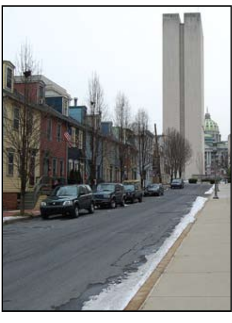
Capital Street, Harrisburg