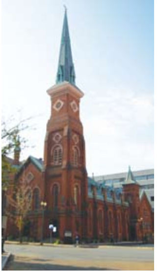
The church, painted gray, circa 1880s (left). In the 1920s, the original red-brick facade was restored, as it remains today (right).

It also has served as a center of outreach for a number of help programs. It currently houses the International Service Center, an organization that provides assistance to immigrants trying to adjust to their new lives in the United States.