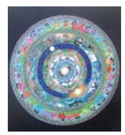
One of Piperberg's brilliantly detailed mandalas.

She still sells her posters (in fact, she was startled recently to learn that two of her posters were clearly visible in a recent scene from the TV sitcom "The Office"). Today, though, she has mostly moved away from