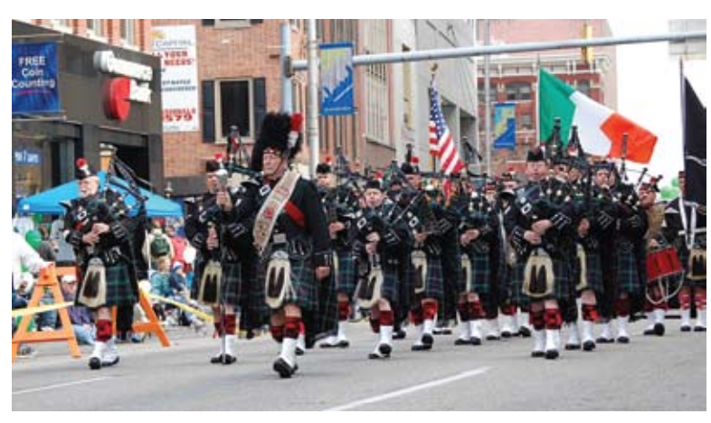
Harrisburg's St. Patrick's Day parade steps off on Saturday, March 20 at 2 p.m., marching through downtown. Wear the green and show your pride!