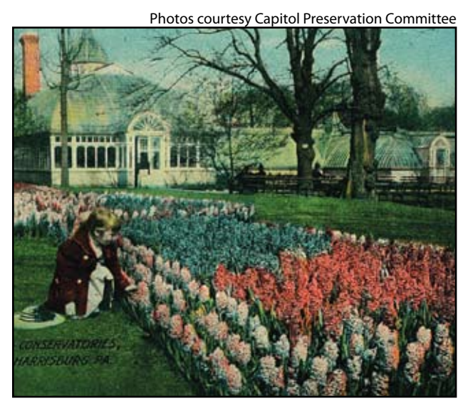
Park days past: The 3rd and Walnut street entrance to Capitol Park (left); the Rose House and conservatories (right) featured nearby flower beds that changed seasonally, showing hyacinths in this picture. Both photos are circa 1890s.

the front circular entrance to the old Hill's Capitol.