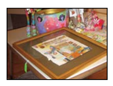
Resident art, p. 14