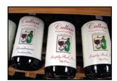
Time for wine, p. 12