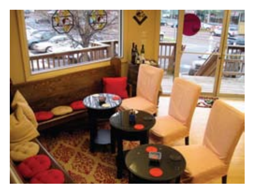
A view of the seating area in the tasting room at Cullari Vineyards & Winery.

One is called White on White, which he said includes Chardonnay and Vidal Blanc, sometimes Catawba, and "then whatever else I want to throw in there. It's basically the same recipe each time" with some subtle changes. "I think the strength of small wineries like mine and most of the others in Pennsylvania is that you can experiment. You know,