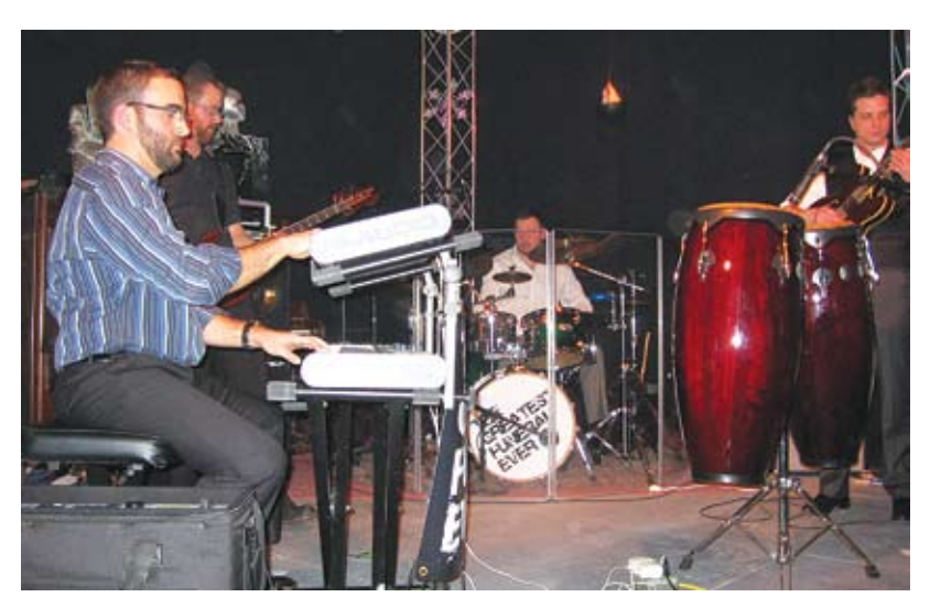
The fun in funeral: A full house was brought to life recently at Stage on Herr.

In its brief history as a band, The Greatest Funeral Ever has stuck pretty close to home. Except for the occasional out-of-area festival, this guartet of talented musicians has played gigs mostly around their home base in New Cumberland.